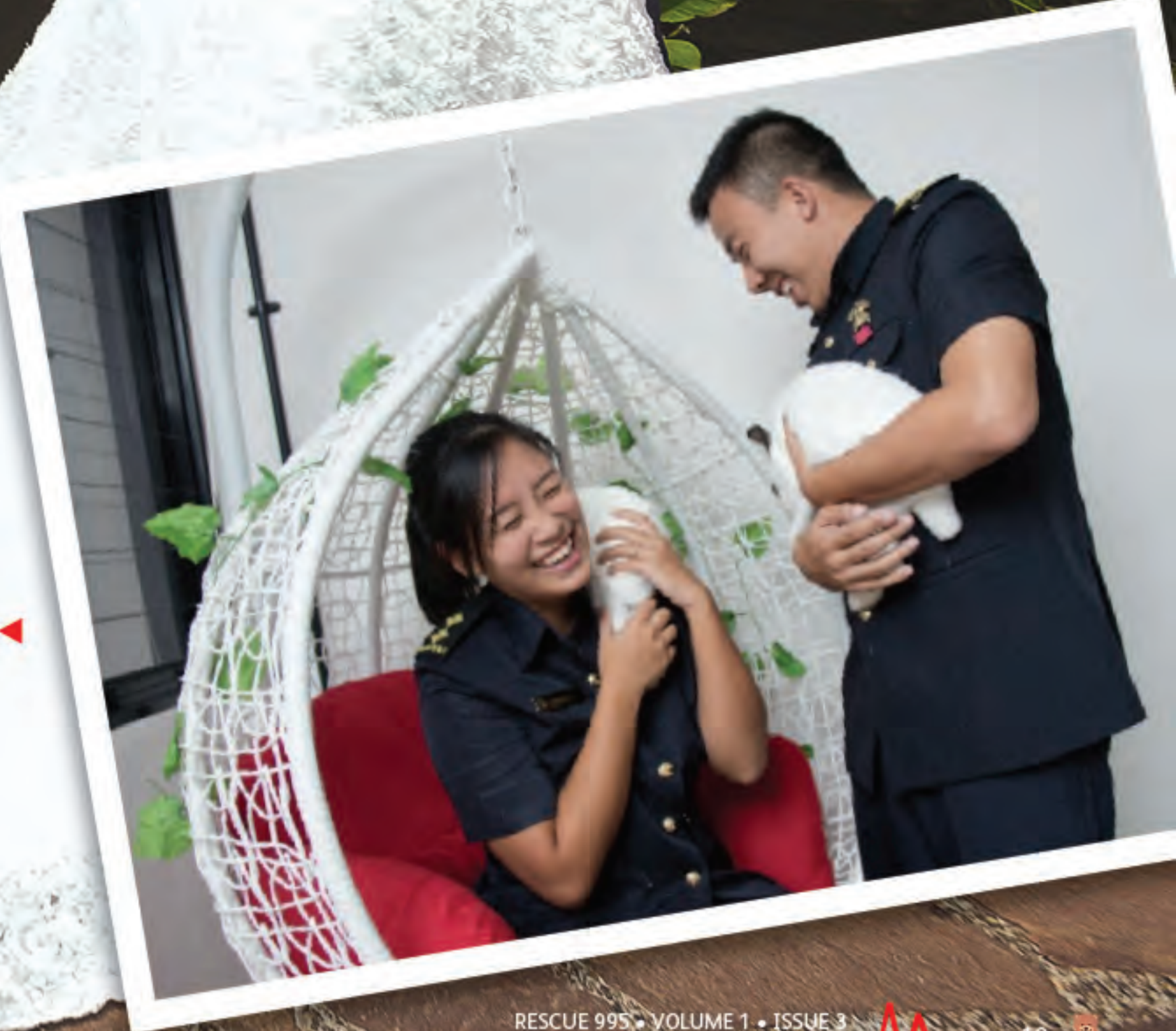
▶ After getting married, they adopted two rabbits named Twinkle and Star.