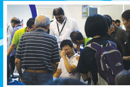
▲ On top of responding to injects sent their way via electronic means, the participants also had to manage 'distressed residents' requesting assistance from the Community Club Operations Centres.

The scenarios required the community leaders to address a wide range of issues, such as dispelling rumours and managing communal tensions within the community arising from a terrorist incident. Fast-paced scenarios were issued during the CPX through various means such as a messaging application, simulated social media platform, emails, television news broadcasts, and real-life role players to mimic the flurry of activities that would happen both on- and off-line. 🚒