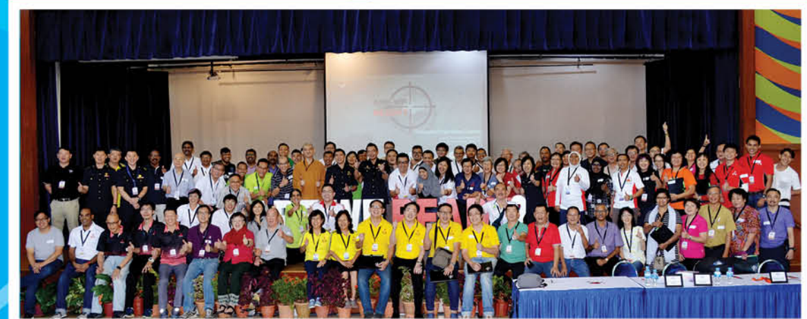
▲ Once the CPX was declared over, the participants were all smiles and felt more prepared in dealing with the fall out of a terrorist incident.