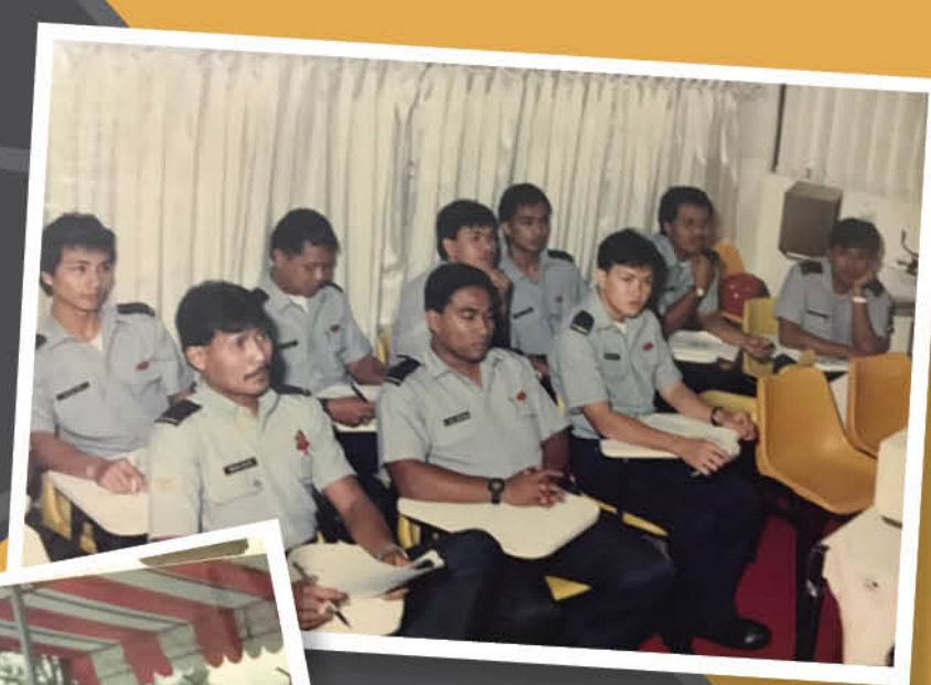
▶ Fast Response Medic trainees undergoing theory lessons.

Fast Response Medics were gradually phased out when SCDF started hiring Paramedics in 1996.