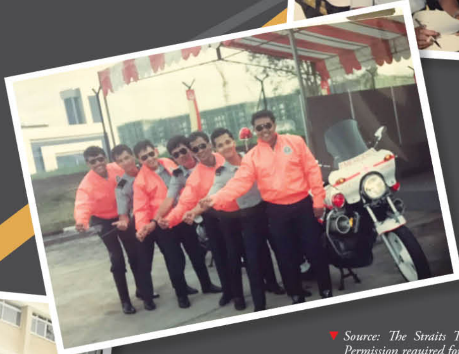
◀ Fast Response Medics wore the orange jacket over their Number 3 uniform as well as a pair of shin guards outside their trousers.