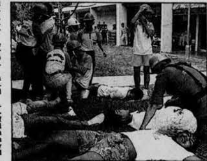
A civil defence auxiliary force could mean volunteers doing specialised tasks alongside regulars. In this 1992 exercise in Bedok, volunteers and a regular work together.

take care of his family and free civil defence officers for more complex duties.