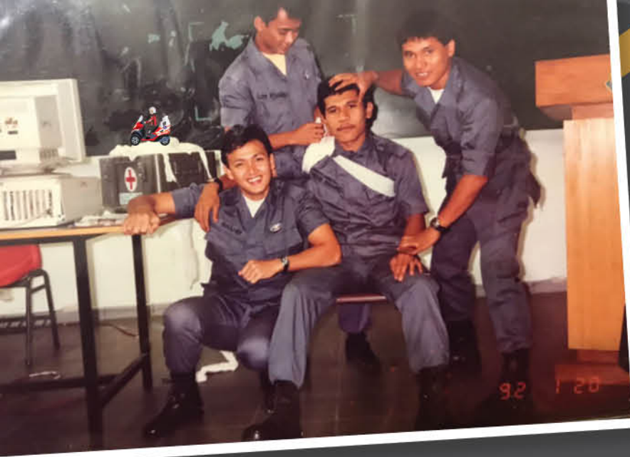
▲ Fast Response Medic trainees undergoing first-aid practical training.

This means that Fast Response Medics have to be as precise as possible when navigating to the incident site as every second matters in an emergency. Instead of leveraging GPS, a technology which was less heard of then, emergency responders memorised the road names and lanes within their operational boundary.