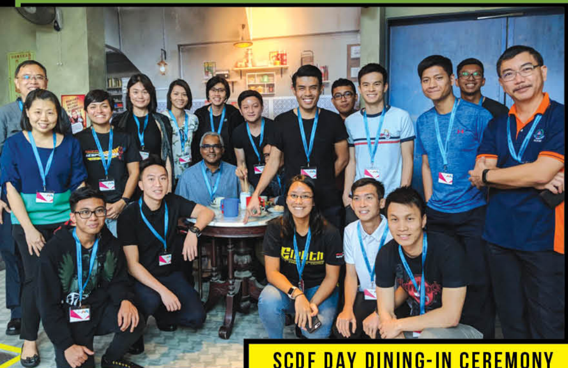
SCDF DAY DINING-IN CEREMONY

G raced by Mr Murali Pillai, Member of Parliament (Bukit Batok SMC) and Member of the Government Parliamentary Committee for Home Affairs and Law, the SCDF Day Dining-In Ceremony was held on 12 April at the Civil Defence Academy. This ceremony commemorates the formation of the SCDF on 15 April 1989 and it is organised for its staff to re-affirm their pledge towards SCDF's core values of Pride and Care.