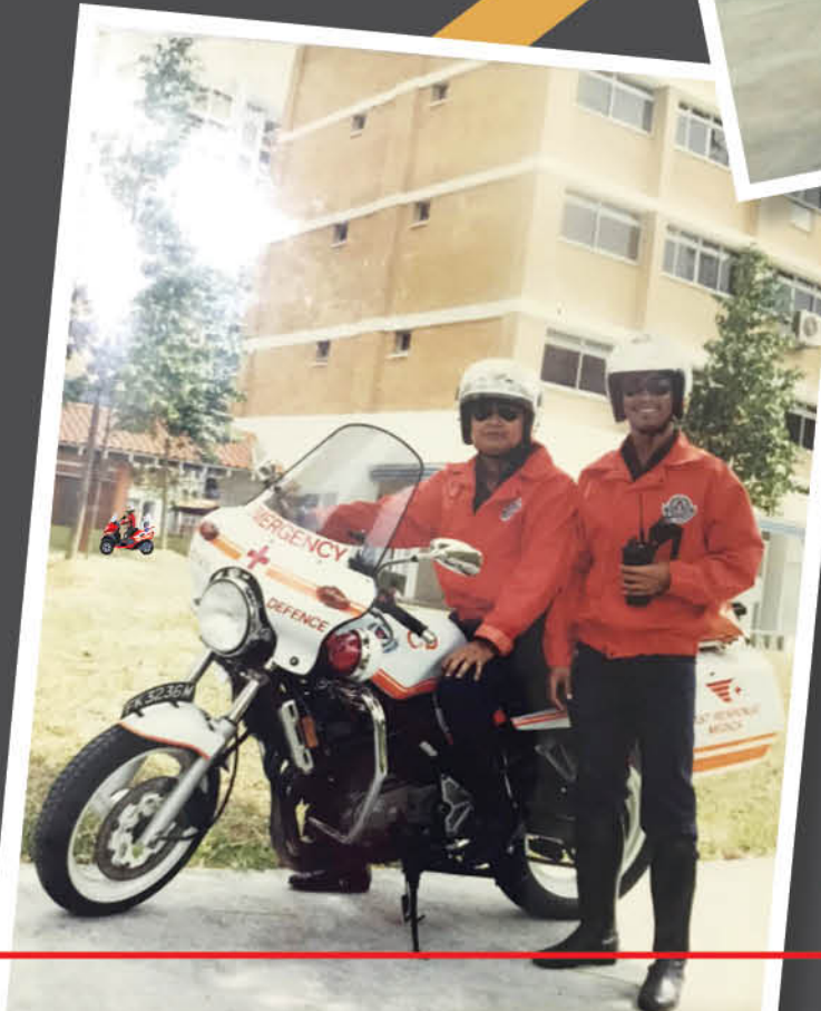
◀ Uniform worn by Fast Response Medics.

▼ Source: The Straits Times © Singapore Press Holdings Limited. Permission required for reproduction. This article was first published on 29 April 1992.