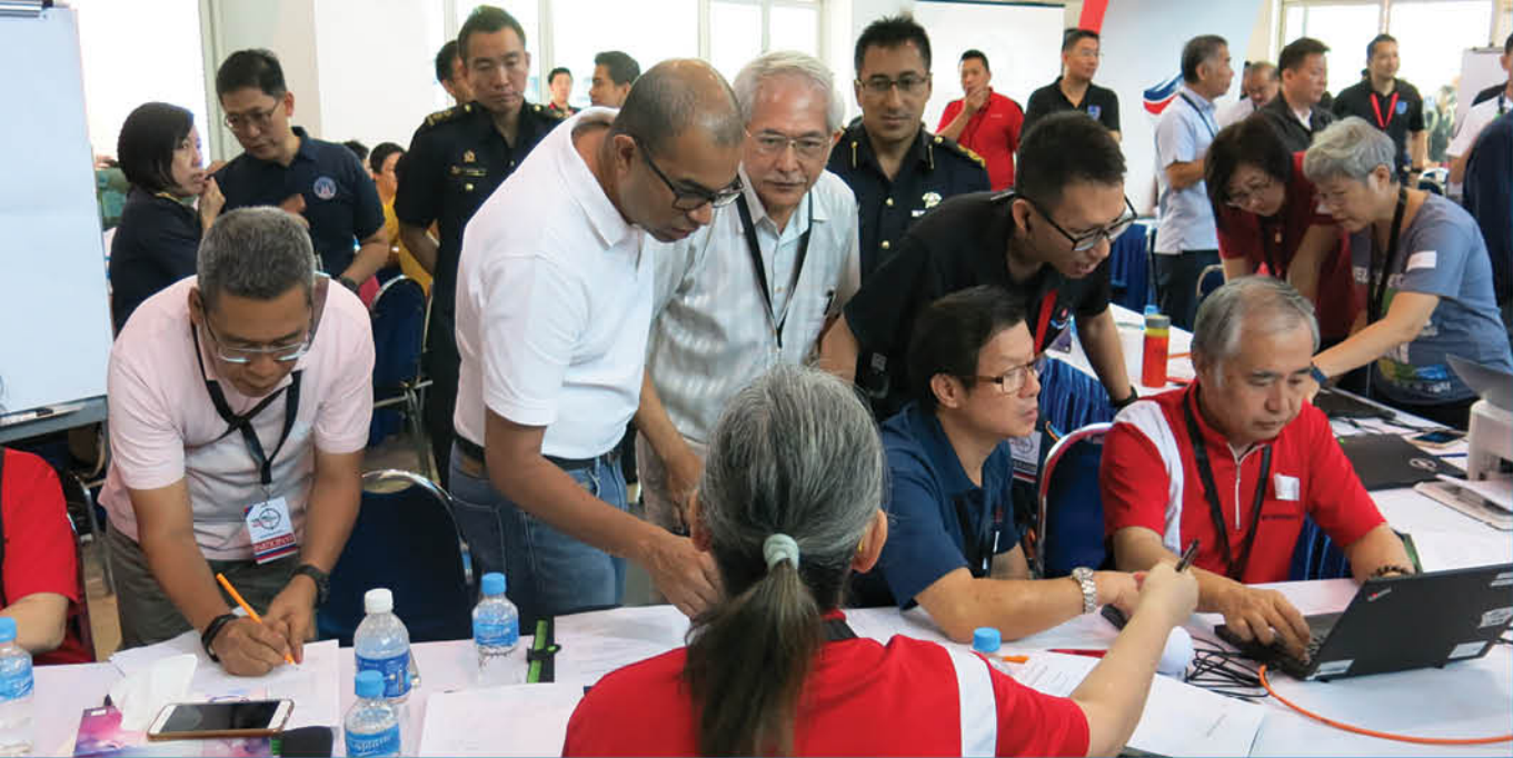
▲ Guest-of-Honour Dr Janil Puthucheary being updated by the CPX participants on their course of action during the exercise.