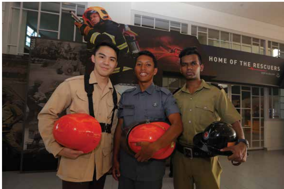
The uniforms worn by SCDF career officers and NS personnel have evolved over the years. For example, the grey colour uniform (second from left) was replaced by the present day loyal blue uniform in September 1995.