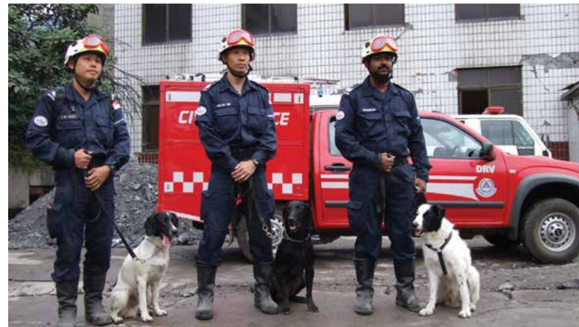
Search Platoon Dog Handlers at Operation Lionheart Sichuan, China in 2008.

Major Tang Peng Seng was one of the pioneer officers behind the set-up of the SCDF K9 Unit.