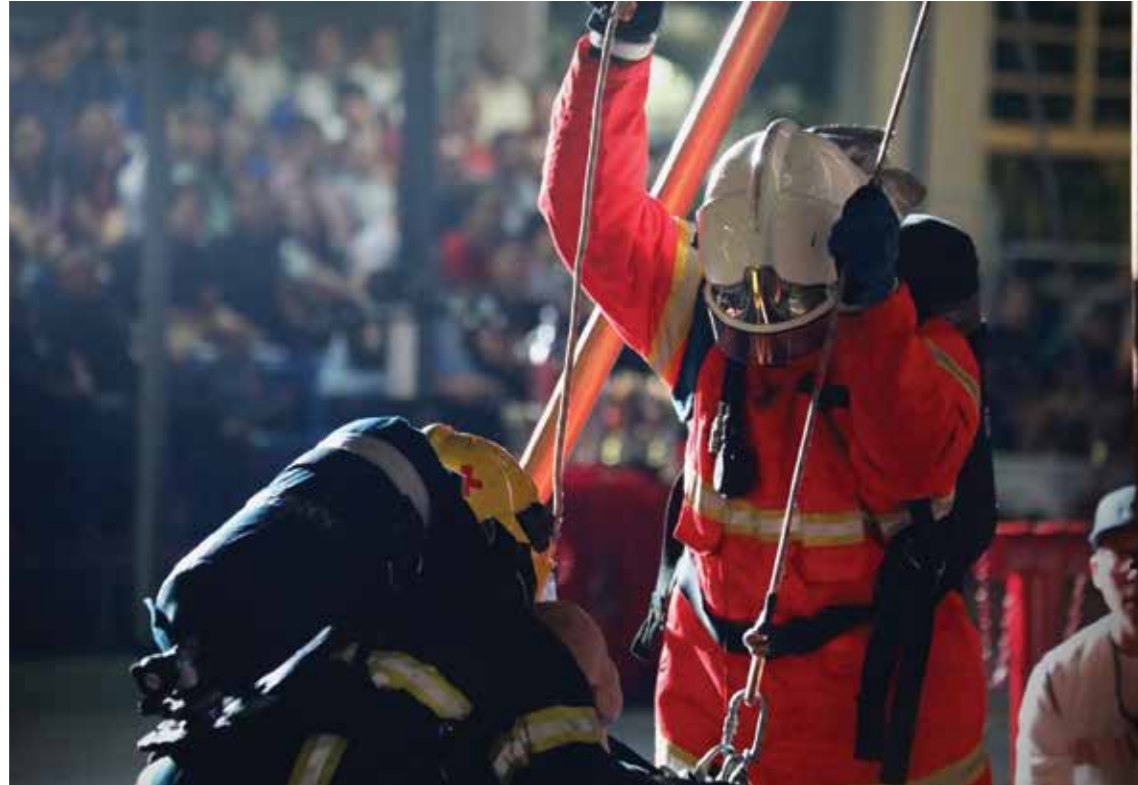
Top: Falconites' Challenge 2017 saw the inaugural participation of external stakeholders including partners from the grassroots, National Civil Defence Cadet Corps as well as corporate companies.